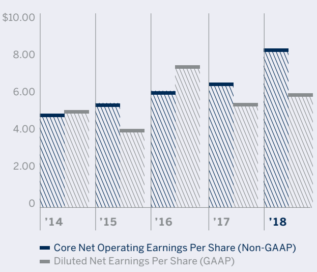
EARNINGS PER SHARE (For the year ended December 31)

AFG's Earnings per Share data for the years ended 2014-2018 is shown here. AFG believes that core net operating earnings is a useful measure for analysts and investors in considering ongoing operating trends for AFG.